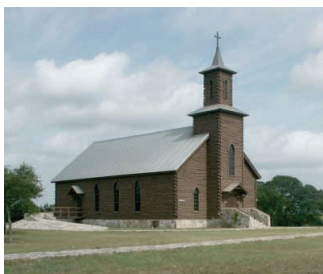
Spiritual Renewal Center Chapel

♥ Personal Needs: Each person is challenged to review the decision-making process and to examine the motives for seeking marriage.